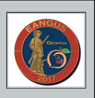
This is the EANGGA Conference Pin design we used for the All States Night during the EANGUS National Conference!